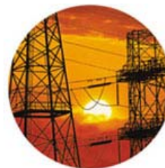
Uses Less Energy

This Offer is Available Only Until October 31 st 2009*