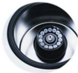
Extensive Rotor Library